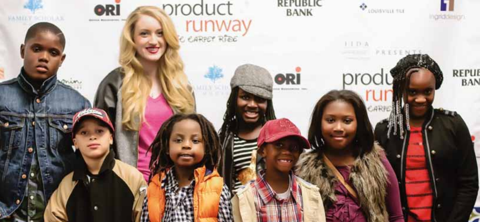
Saturday – FSH young scholars pose on the red carpet at IIDA's Product Runway.