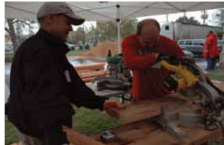
On Thursday, October 31st, volunteers braved cold, rainy weather for Prep Day, to get the site and supplies ready for Build Day two days later