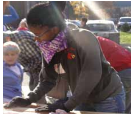
More than 200 volunteers began working before sunrise on Saturday, November 2nd, building the playground, benches and a stage and completing art projects such as mosaics and murals.