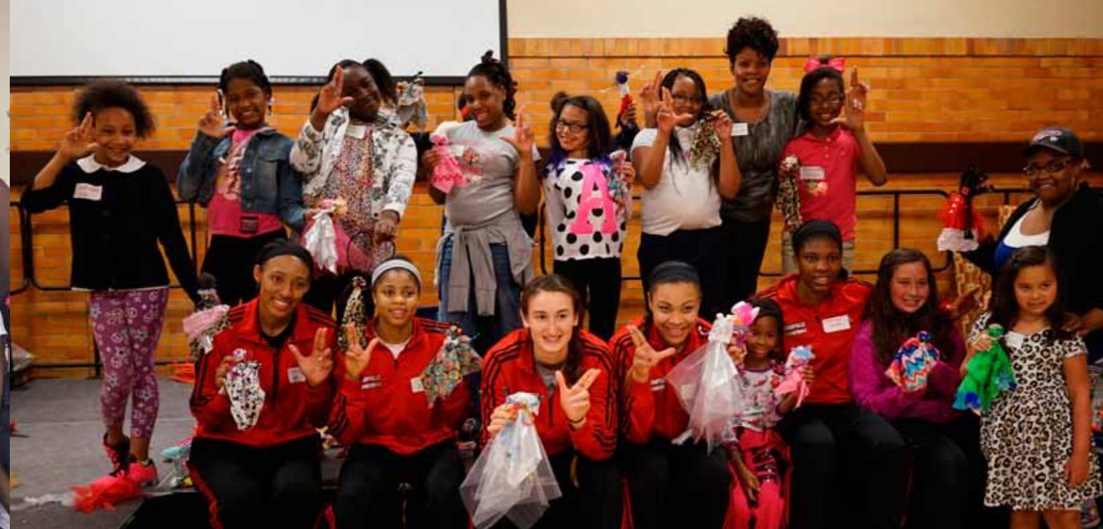
UofL's student-athletes from the Women's Basketball team and FSH girls, after creating their own "Affirmation Dolls".