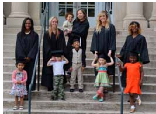
COVER PHOTO: Five members of the Class of 2015 with their future scholars.