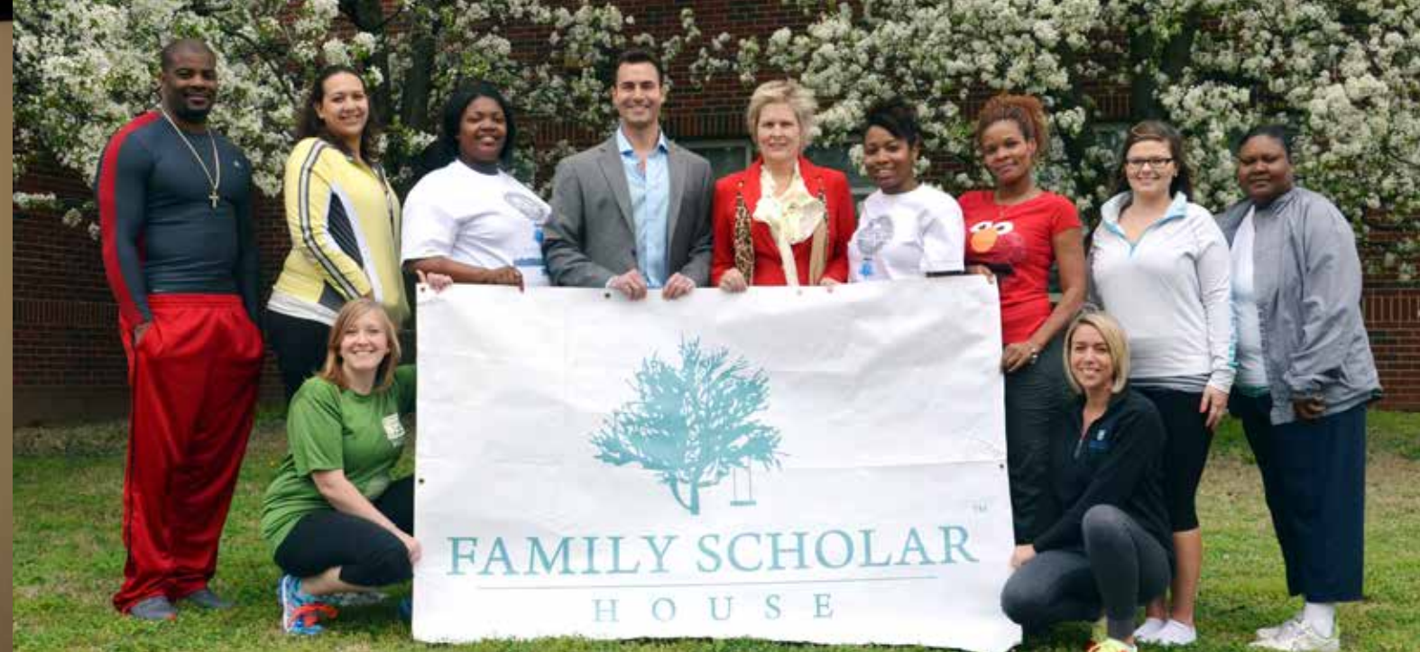
Sunday – Members of the Family Scholar House Kentucky Derby Festival miniMarathon Team presented by Sidebar at Whiskey Row.