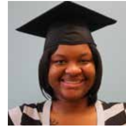
HOLLAND BRANCH Mother of Tristan (age 2)