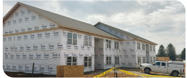
Pictured above are the 48 student-parent apartments that are currently under construction for Family Scholar House at ECTC.